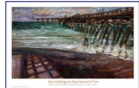
"Sun Setting on Sportsman's Pier"