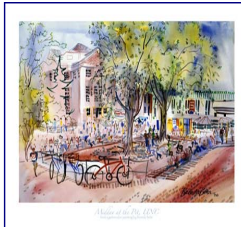
"Midday at the Pit, UNC"